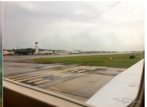
Landing at Antigua