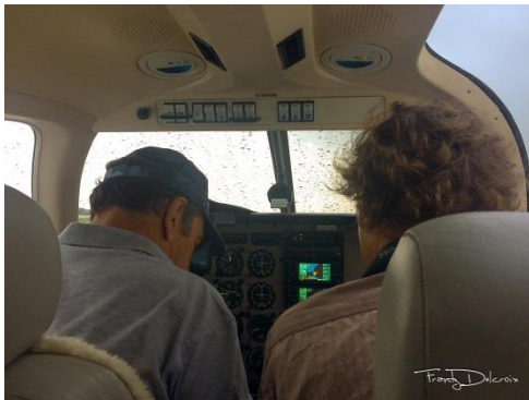
Preparing the plane for the IFR flight