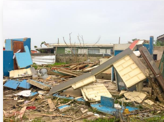
Some damage on Barbuda