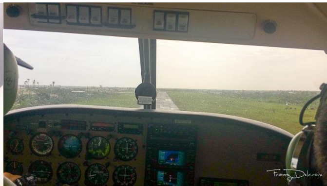
Landing at Barbuda