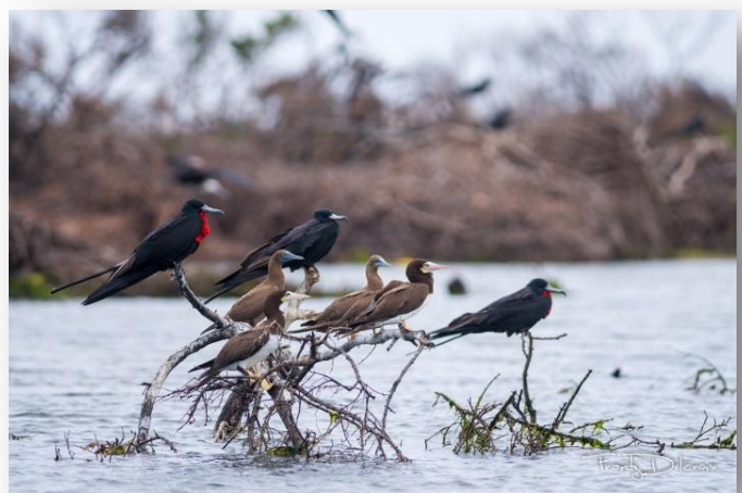
Brown Boobies with the frigatebirds