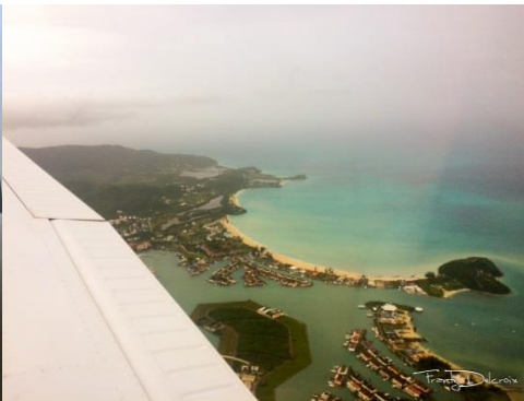
A look on Antigua