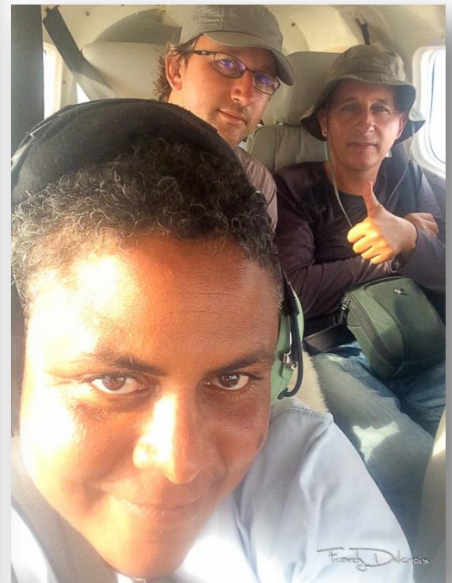
In the plane, back home